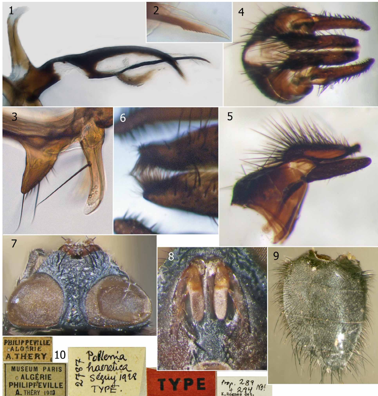
FIGURES 1–10. Pollenia haeretica Séguy, male (1–5 from “Tunisia, 10 km N Korba ...” specimen in ZMUC; 6, 9 from “Sorgono, Sardegna ...” specimen in BMNH; 7–8, 10 from lectotype of Pollenia haeretica Séguy in MNHN). 1. Aedeagus, left lateral view. 2. Tip of paraphallic process (large magnification). 3. Pre- and postgonites. 4. Cerci and surstyli, posterior view. 5. Cerci, surstyli, epandrium and bacilliform sclerites, left lateral view. 6. Tip of cerci (large magnification). 7. Head, dorsal view. 8. Facial region, from in front. 9. Abdomen, oblique view. 10. Four original labels and K.R.’s label referring to MNHN slides.