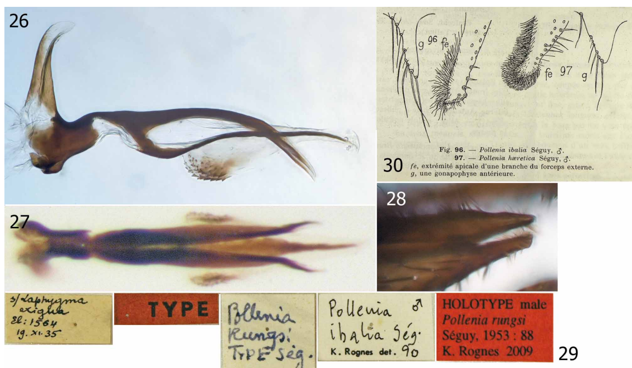
FIGURES 26–30. 26–29. Pollenia ibalia Séguy, male (from holotype of Pollenia rungsi Séguy in MNHN). 26. Aedeagus, left lateral view. 27. Aedeagus, dorsal (posterior) view. 28. Tip of cerci, slightly oblique view. 29. Three original labels, determination label and holotype label by K.R. 30. Right pregonite and tip of cercus of P. ibalia (left) and P. haeretica (right) [reproduced from Séguy 1930: 148, figs. 96 and 97, by permission].

printed]; (4) my holotype label ( ibalia Séguy). The specimen has been dissected by K.R.. The abdominal T1–5 are glued to a card on the pin above the labels, and the ST1–5 and genitalia are kept in glycerol in a glass microvial below label (3). Paratypes (2 males, both in MNHN): 1 male labelled (1) “MUSÉUM PARIS // MAROC // MOYEN ATLAS // RAS EL KSAR 900 m // F LE CERF // 12/13 VI 1929” [printed on greyish blue label]; (2) “ ibalia / E. Séguy det. 19” [handwritten by Séguy, except last line which is printed]; (3) “ag 292 / K. Rognes det.” [handwritten in pencil on white label, except last line which is printed; ag = appareil genital]; (4) “Genital slide / no. 292 / “ Pollenia ibalia n.sp.”” [printed on red label; label prepared by K.R.]; (5) my paratype label ( ibalia Séguy). Slide 292, also in MNHN, is a Canada balsam mount of the ST5 and the genitalia labelled “292” [left side of slide] and “ Pollenia / ibalia / n.sp. ” [right side] [all text in pencil in Séguy’s handwriting]. • 1 male labelled (1) “MUSÉUM PARIS // MAROC // MOYEN ATLAS // RAS EL KSAR 900 m // F LE CERF // 12/13 VI 1929” [printed on greyish blue label]; (2) my paratype label ( ibalia Séguy). Not dissected, but cerci and surstyli clearly visible.